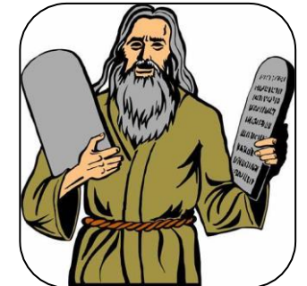
Moses and the Ten Commandments